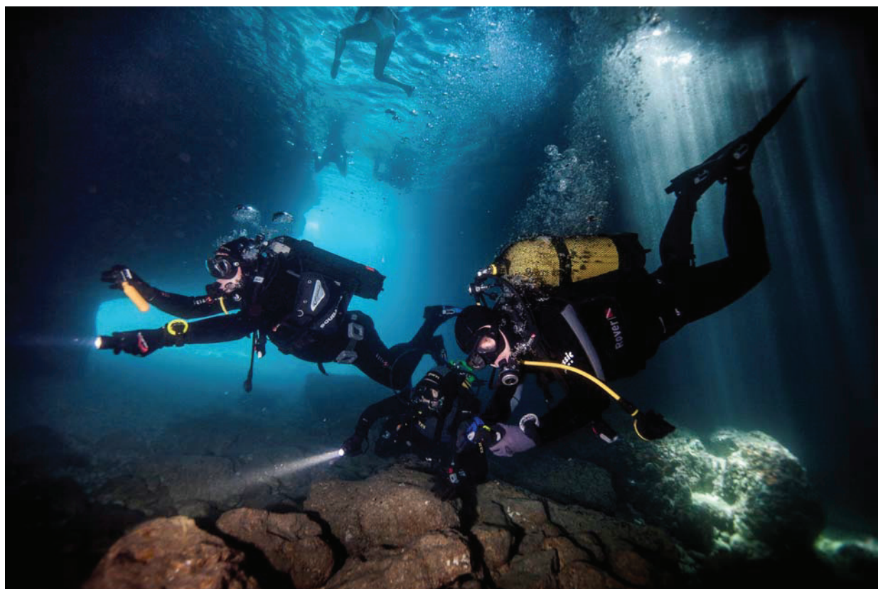
Bozidar Vukicevic / CROPIX

well as visit a sunken wreckage of Admiral Ship Vis in underwater vicinity. Those who are just starting their career below surface can practice the craft in resort's pool. The site is located just next to Runka Camp.